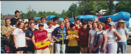
Governor Granholm paddled w/ us as part of her "Hidden Treasures" Tour! Here she posed w/ the Boyne City High School 8th graders after her Rafting trip. During the trip, she stated, "I LOVE this! What an absolutely gorgeous river! I would highly recommend this trip to everyone!"